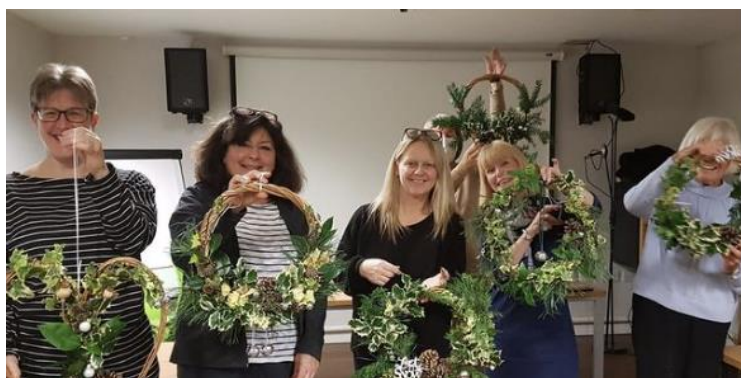
Wreath making at the Christmas carers hub

We run regular Carers' Hubs in different locations around the city, adapting these to meet need. We've heard lots of positive feedback from carers about how this has helped to reduce isolation and build relationships with other carers in similar situations.