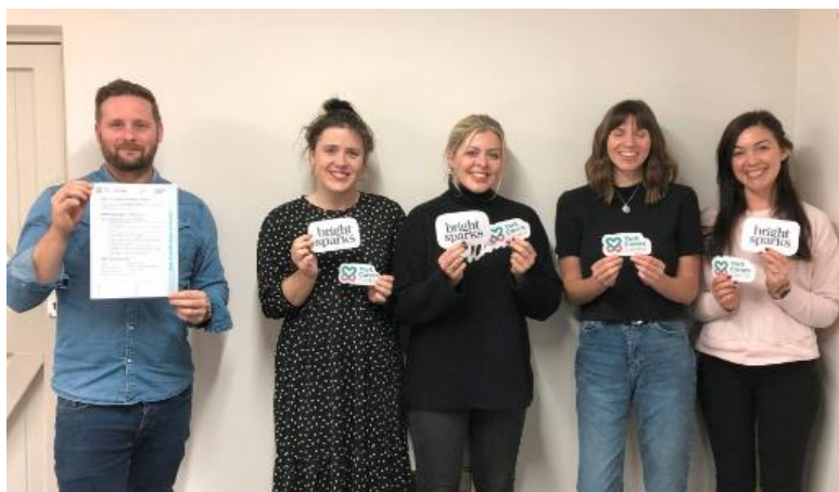
Bright Sparks Agency on achieving our Carer Friendly Employer Charter

We engaged with 35 local employers this year to raise awareness of carers' needs in the workplace. We are proud to have continued our partnership work with large organisations, such as York and Scarborough Teaching Hospitals NHS Foundation Trust through their launch of the Caring 4 Carers staff network.